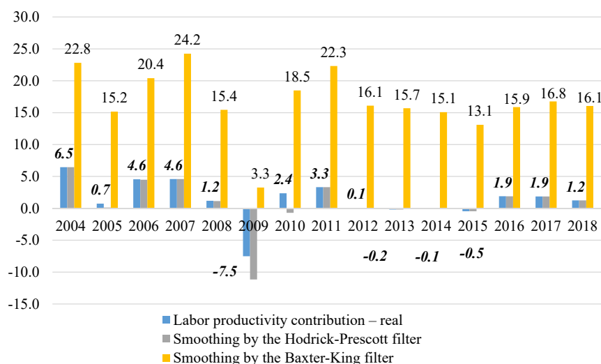
Fig. 1. Dynamics of the contribution of real and potential labor productivity in Ukraine with the use of different smoothing procedures in the rate of change of the corresponding GDP, pp, 2004–2018 (calculated by the author based on data [24, 25])

In Fig. 1 the data are given for actual productivity ( italics ) and potential based on the Baxter-King method.